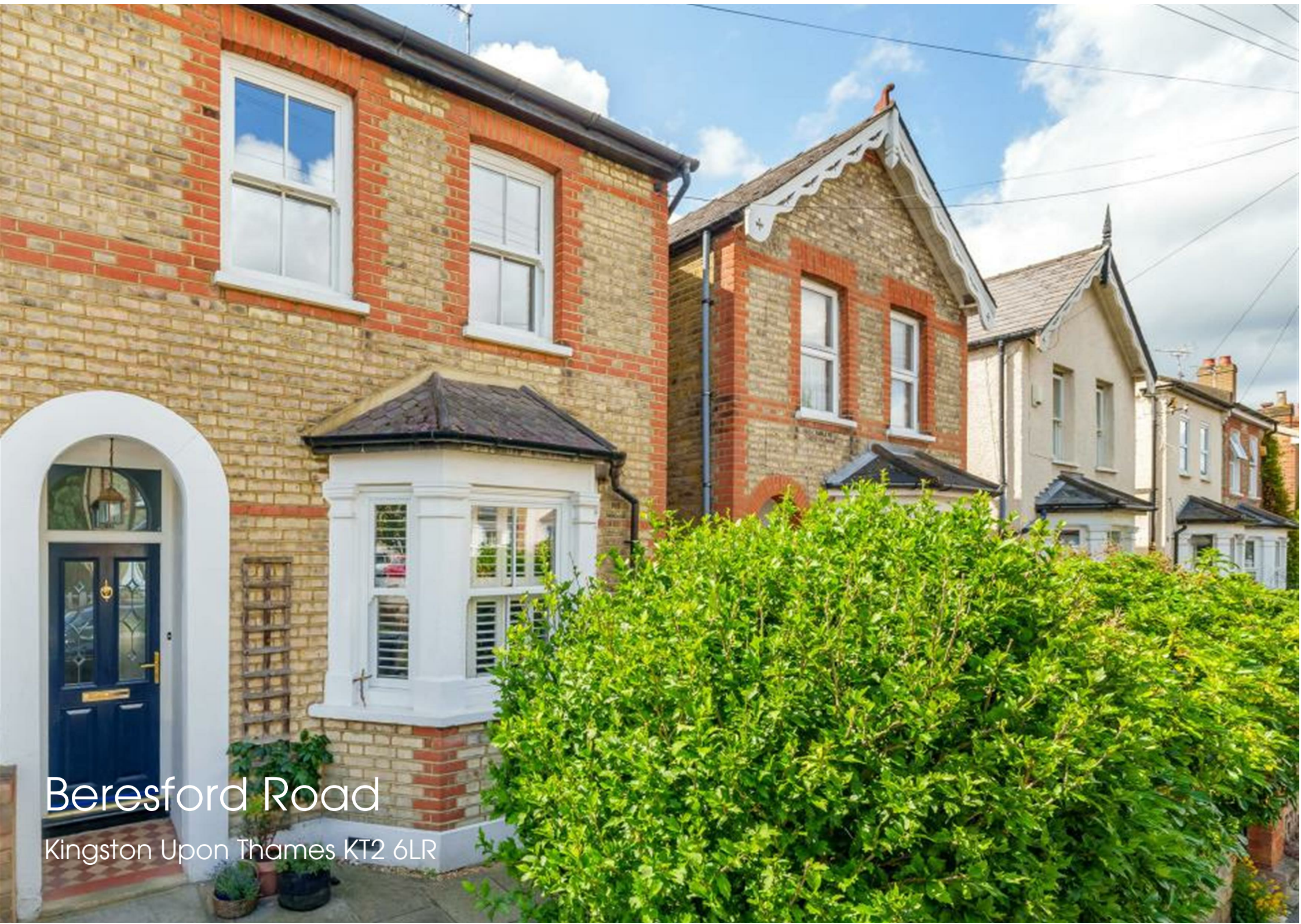
Beresford Road Kingston Upon Thames KT2 6LR

34 Richmond Road Kingston upon Thames Surrey KT2 5ED www.gibsonlane.co.uk Tel: 020 8546 5444